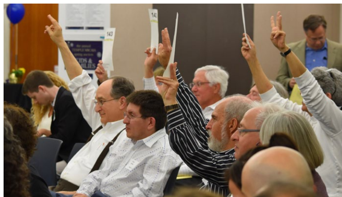
Lots of bids on this offering