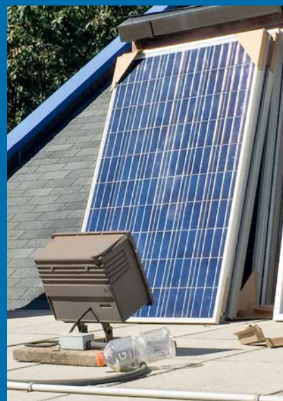
See more solar panel photos on page 12.